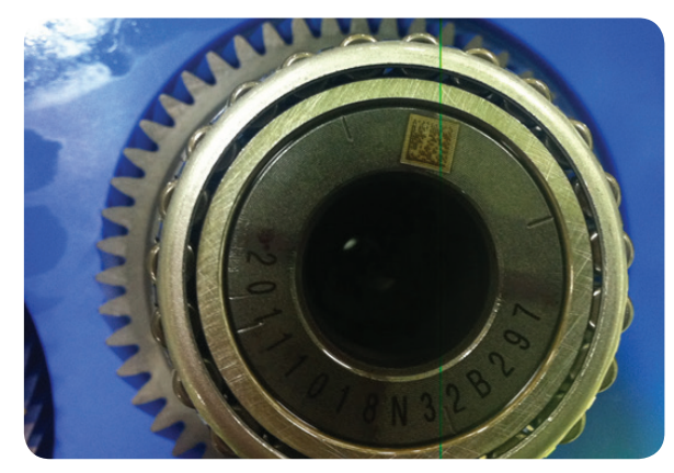
A low-contrast 2-D Data Matrix code on a Kia Motors transmission part. The Cognex 2DMax+ code reading algorithm can read virtually any barcode regardless of the damage or the surface it is marked on.

Because Kia Motors' auto parts are assembled with anti-rust oil spray, one of the challenges for the reader is caused by oil on the code. Additionally, the 2-D Data Matrix codes can be further damaged by dirt or scratches, even though they have been washed and kept clean. Furthermore, the size and varying quality of the code marking made the matrix codes difficult to read. However, these challenges are effectively handled by DataMan barcode readers. The Cognex 2DMax+™ code reading algorithm can read virtually any barcode regardless of the damage or the surface it is marked on. In addition, Cognex barcode readers offer Ethernet connectivity so they can integrate into the factory network and directly communicate with a PLC without the need of an additional transmission device.