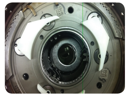
Multiple 2-D Data Matrix codes on a single Kia Motors transmission part.

Kia Motors is now able to match the manufacturing cycle on time, and increase work efficiency and production yield while lowering manufacturing costs.